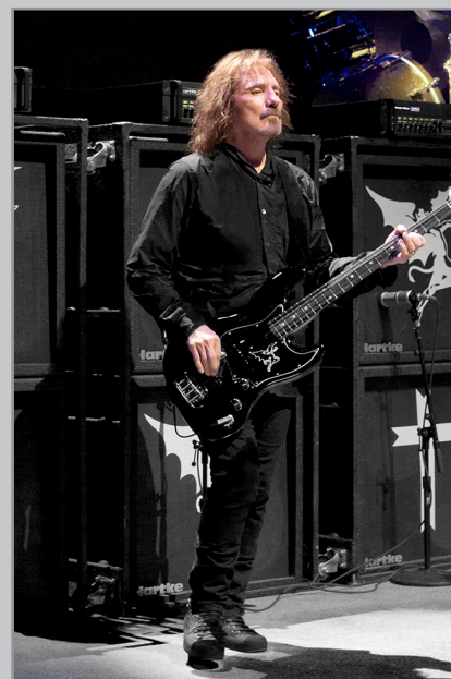
Geezer Butler of Black Sabbath uses Kilo amplifiers